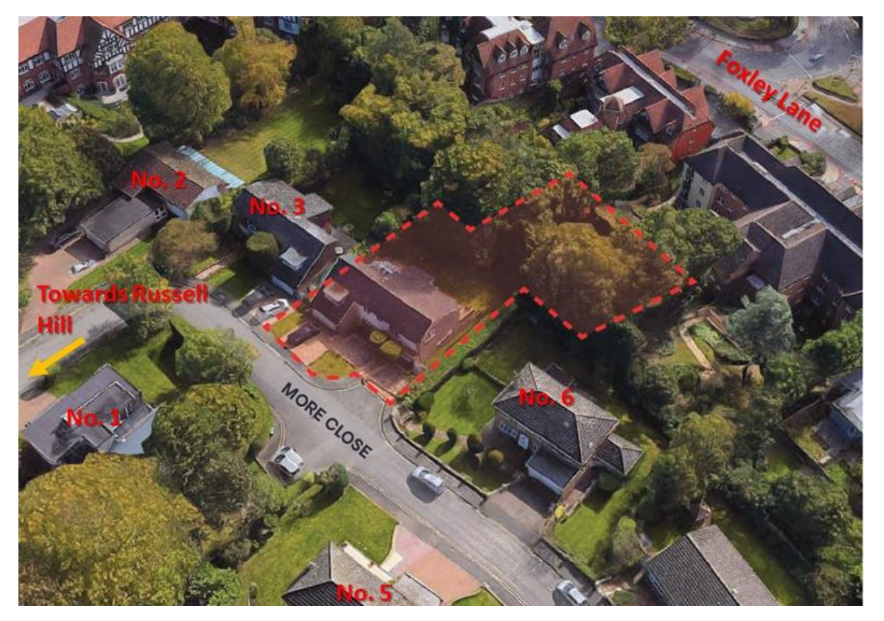
Fig.7 – correction as it included wrong placement of adjoining properties Nos 2 & 3, it should be as follows: